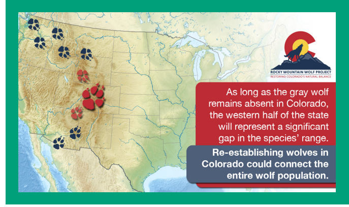
"The Missing Link" infograhic

Depending on the age group you are working with and the amount of time you have available, you could have your students do one or all of the following activities: