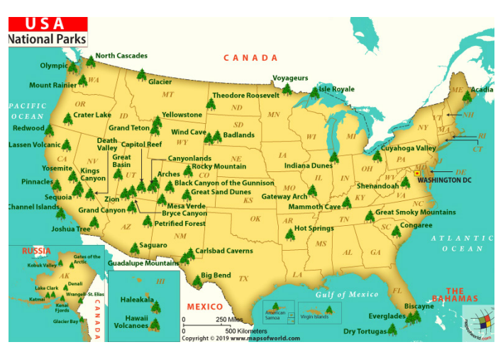
this map which shows the US National Parks