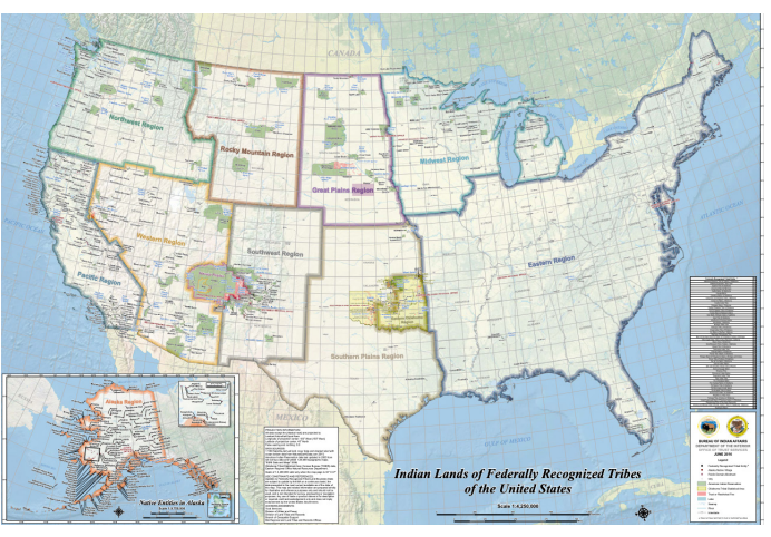
From the U.S. Department of Interior, Indian Affairs, this map which shows the Map of Indian Lands in the United States