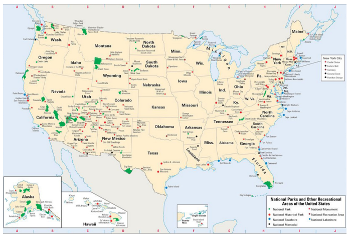
From National Parks Service, this map which shows America's National Monuments

To engage student interest, and activate prior knowledge, as well as practice critical thinking/questioning skills, it would be interesting to present the maps below alongside each other: