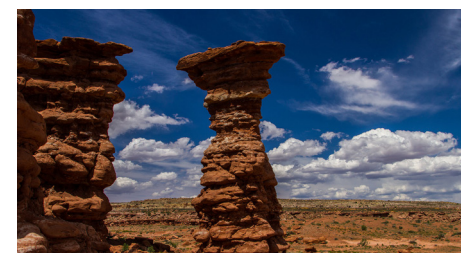
Chimney Rocks, Photo: Josh Ewing