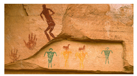
Cedar Mesa

https://www.cbsnews.com/ video/nature-bears-ears-nationalmonument/