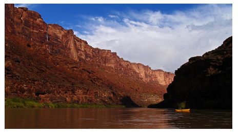
San Juan River