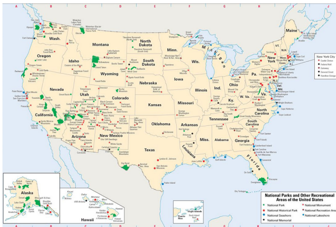
From National Parks Service, this map which shows America's National Monuments

To engage student interest, and activate prior knowledge, as well as practice critical thinking/questioning skills, it would be interesting to present the maps below alongside each other: