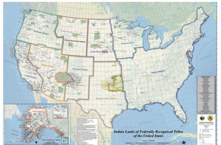
From the U.S. Department of Interior, Indian Affairs, this map which shows the Map of Indian Lands in the United States