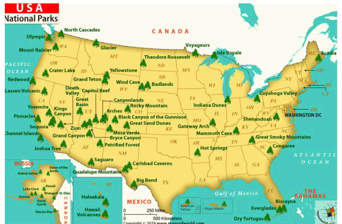
From Maps of the World, this map which shows the US National Parks